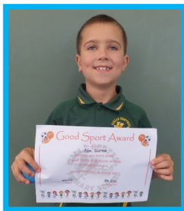
Aston Grade 2

Because you have been a good sport, a gracious winner and have included others.